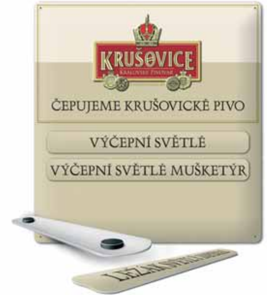
Magnets are great for variable information boards.