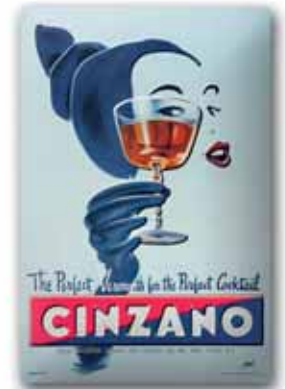
your finished sign