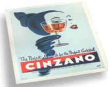
your artwork or data